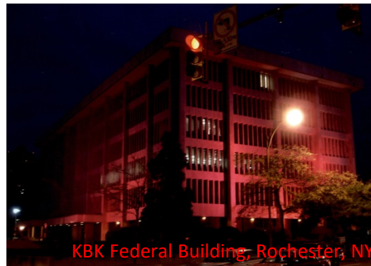
KBK Federal Building, Rochester, NY

October 23-31 Red Ribbon Week The nation's oldest and largest drug abuse prevention awareness program.