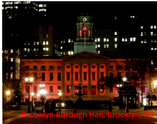
Brooklyn Borough Hall, Brooklyn, NY

Go Red for Red Ribbon brings awareness to living a drug-free life by lighting up buildings, landmarks, businesses, and bridges in red!