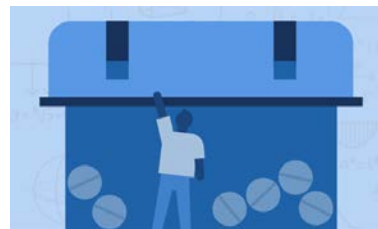
STRATEGIES AND AVAILABLE TREATMENTS

Explore the science of opioids, including their impacts on the brain/body, plus practical ways of preventing dependency. Employees will get an idea of what it feels like to physically experience the science of opioids.