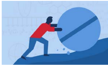
BRAIN AND BODY

Learn the basics of what opioids are, while discovering the origins of the epidemic and how it has evolved. Employees will gain perspective into how the opioid epidemic affects people on a personal level.