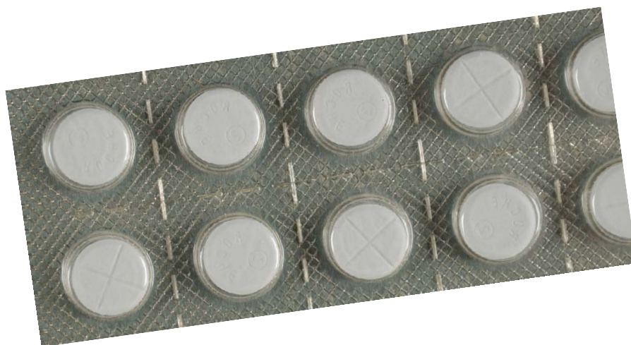
Blister pack of Rohypnol tablets

Rohypnol is a Schedule IV substance under the Controlled Substances Act. Rohypnol is not approved for manufacture, sale, use, or importation to the United States. It is legally manufactured and marketed in many countries. Penalties for possession, trafficking, and distribution involving one gram or more are the same as those of a Schedule I drug.